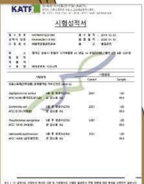
Test Report of Salmonella