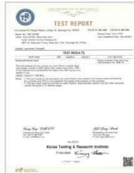
Single Oral Dose Toxicity