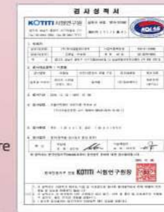
KOTITI Test Report