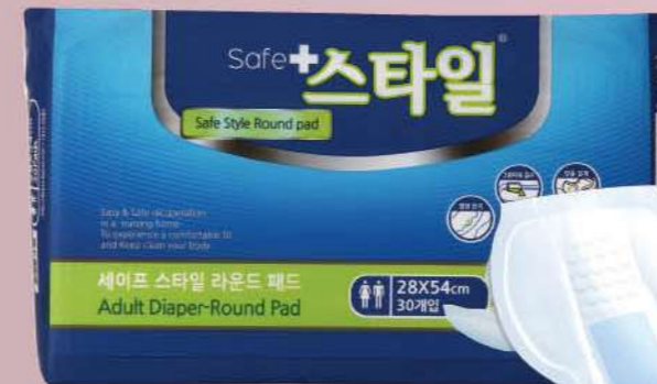
Basic Type 30 Sheets