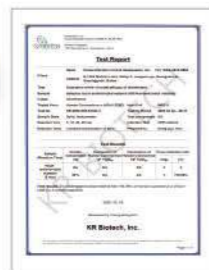
Test Report of Corona Virus