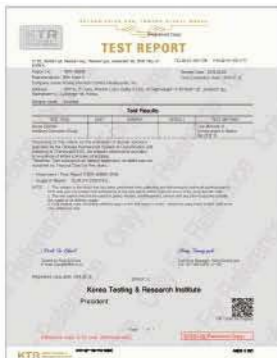
Acute Dermal Irritation