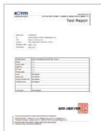
Test Report of Sterilization