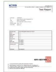
Test Report of Sterilization