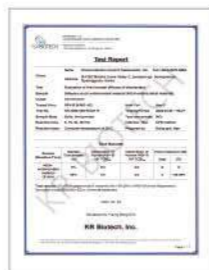
Test Report of RSV Virus