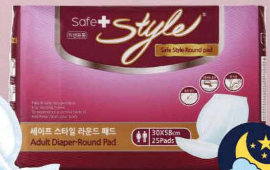
Long Type 25 Sheets