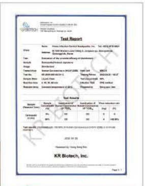
Test Report of Corona Virus