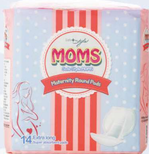
MOMS Pad 14 Sheets