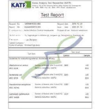
Test Report of Salmonella