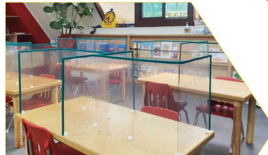
*Image of product used at kid's facilities

*It has same export specification with Basic Type