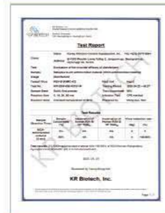
Test Report of RSV Virus