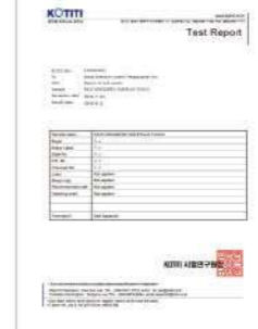
Test Report of Sterilization