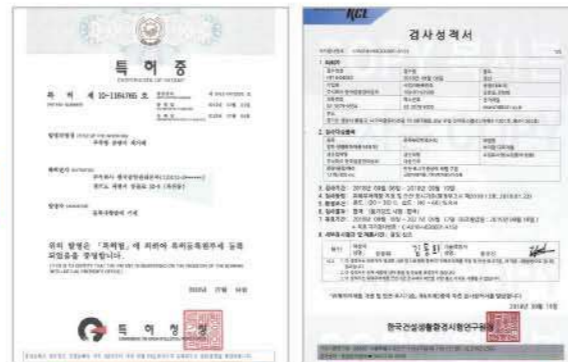
Certificate of Patent