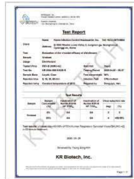
Test Report of RSV Virus