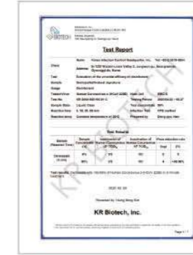
Test Report of Corona Virus