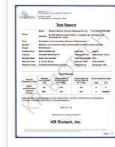
Test Report of RSV Virus