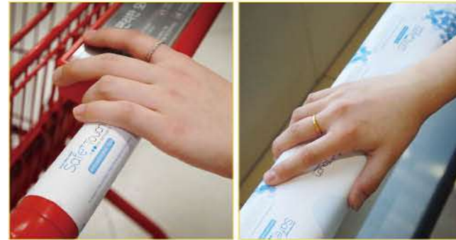
*Photos of product used in the mall