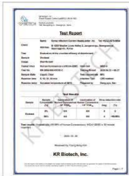
Test Report of Corona Virus