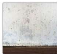
KCL Test Report