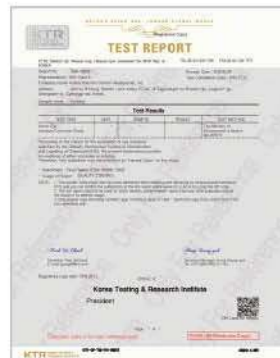
Acute Eye Irritation/Corrosion