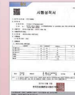
KCL Test Report