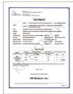
Test Report of Corona Virus