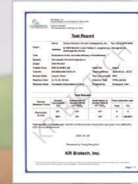
Test Report of RSV Virus

Test Report Test report of sterilizing 99.99% of Corona Virus and RSV Virus Test report of sterilizing Salmonella (Domestic Unique) KCL Microbial Limit Test Undetected, KCL Hazardous Heavy Metal Test Undetected