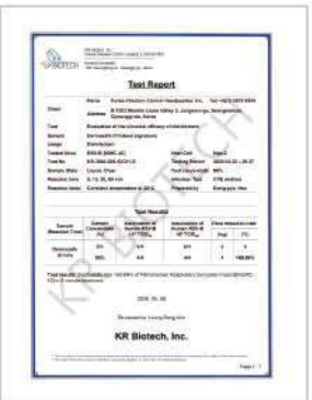
Test Report of RSV Virus