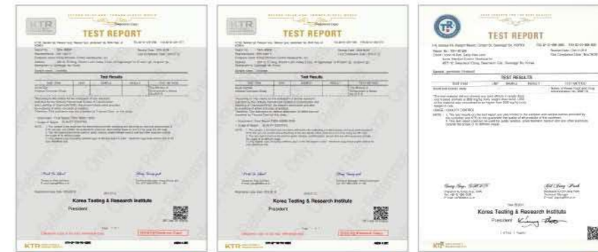
Acute Eye Irritation/Corrosion