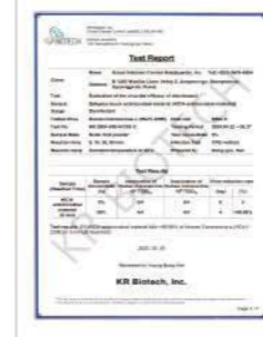
Test Report of Corona Virus