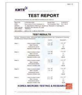
Test Report of Sterilization